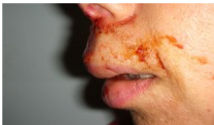
Day 1: Side view the morning after the accident.