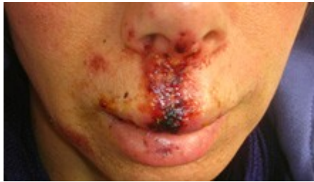
Day 2: Completely covered with scurf, dry wound less edema.