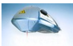
The therapy was made with the