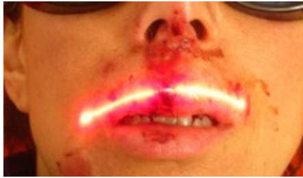
Treatment of the horizontal total lip and mouth area to reduce edema and increase healing.