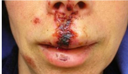
Day 4: Reduced wound size, reduced edema.