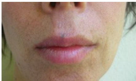
Day 9 (last two days no laser therapy): Except of a tiny spot which is still fading away, the skin and deeper tissue layers are normal in color and size and -very important- scar free.