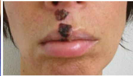
Day 7: The crust already started to fall of. Beside some redness the skin was normal.