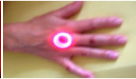
Treatment of the joint injuries with pulsed circle.