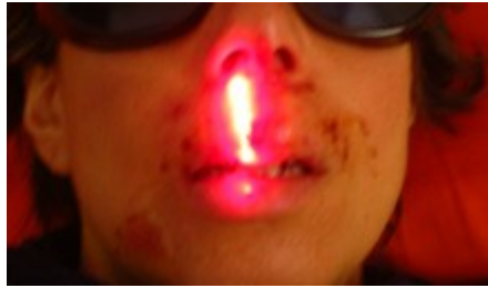
Treatment of the vertical wound center to for cell stimulation to increase healing.